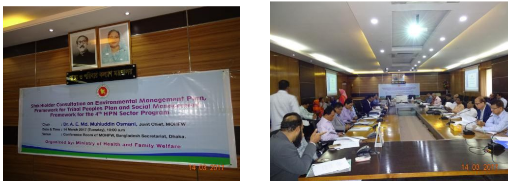
Figure A1: Consultation workshop organized by MOHFW on 14 March, 2017

The consultation was organized by the Ministry of Health and Family Welfare (MOHFW) on 14 March, 2017 in the Conference Room of MOHFW, Secretariat complex, Dhaka. The participants included a broad range of stakeholders from various departments and ministries of the Government of Bangladesh, officials from the MOHFW, health care facilities from Sylhet and Chittagong division attended the meeting, tribal peoples' representatives from the CHTs and plains regions and various CHT institutions such as the CHT Regional Council and Hill District Councils. (List of the participant is given below in the Annex 6) (Figure A1). The meeting was chaired by Joint Chief, MOHFW.